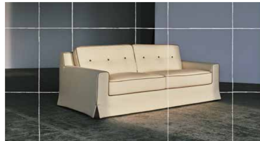
Hermès never fails to live up to its reputation as the global paragon of timeless elegance and peerless craftsmanship, and the Canapé Hermès is a prime example. The fine black leather piping of the off-white sofa is sewn with such precision that Instagram aficionados have referred to it as "piping porn"