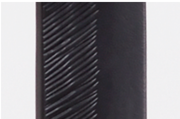
Smooth and Groovy

**** Mati table in oak and ash is only available with Cellular carving pattern.