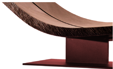
Red metal base