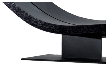
Dark gray metal base