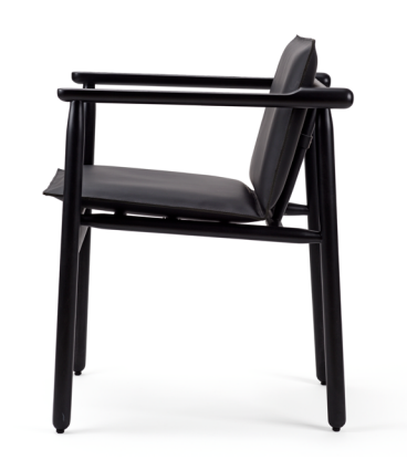
IGMAN CHAIR WITH ARMRESTS